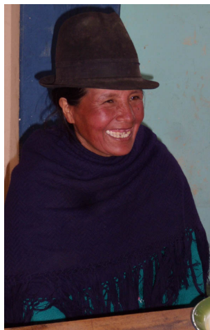
A proud happy student