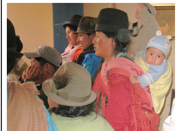
Distributing seeds for their gardens.