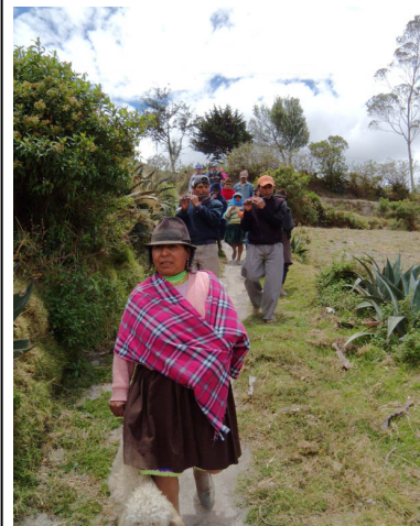
A band accompanies us on our tour of their new gardens.