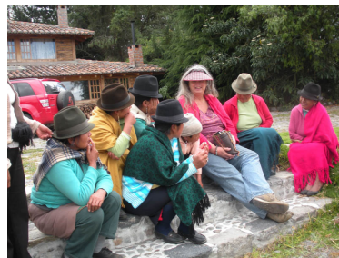
Getting a lesson; lodge in background