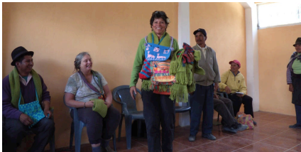
Ing. Sin Fronteras = Engineers Without Borders

The people are incredibly grateful! Everyone was assessed a fee to make these plaques.